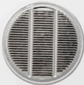
VER3 Round Eave Vent