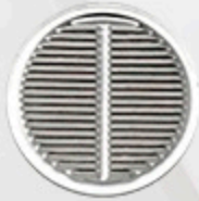
VER2 Round Eave Vent